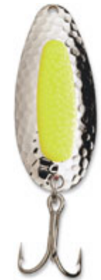
Blue Fox Pixee 3/8 & 1/4 oz