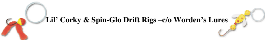
Lil' Corky & Spin-Glo Drift Rigs –c/o Worden's Lures