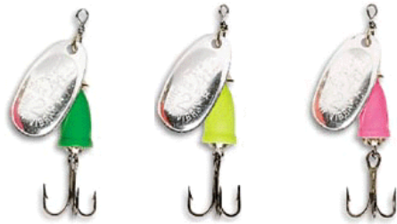
Blue Fox Vibrax Spinner (#5 and #6 for kings)