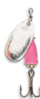
Blue Fox Vibrax #3