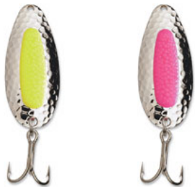
Blue Fox Pixee Spoon (7/8 oz. for kings)