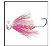
Assorted 3/8 and 1/4 ounce Jigs